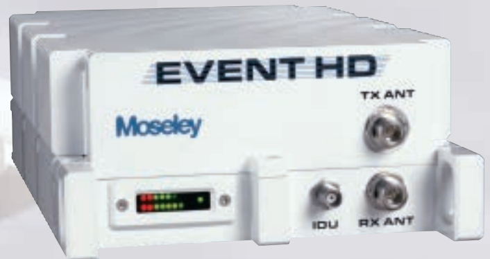
Event HD Outdoor Unit

The Event HD ENG Link provides users with options of multiple HD-Video or SD-Video over DVB-ASI with data rates up to 155 Mbps ‡ . The superior modulation together with Reed-Solomon and Trellis-Coded Error Correction provide unparalleled error-free performance.