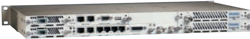
Event HD indoor unit